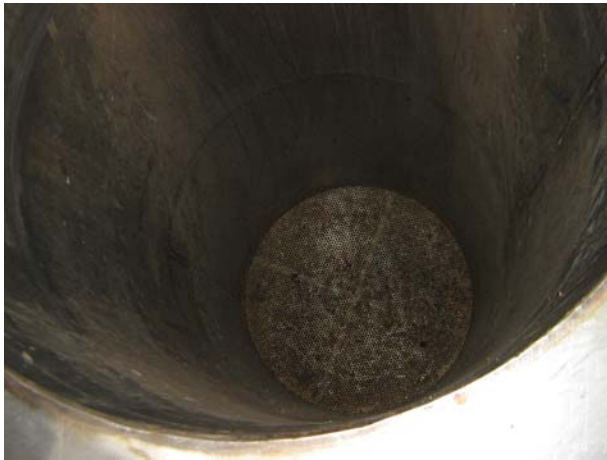
Inside the simulation box

Figure 4 proves that the laboratory test generate landfill gas much quicker than the first order decay model indicates. The results are published by Scheelhaase (1999). However, the laboratory test does not necessarily reflect landfill conditions, since the research objectives at that time were different. Therefore, a new laboratory testing project has been started at Technical University Braunschweig funded by German Federal Ministry of Environment. Figure 5 illustrates the laboratory testing equipment. More results are expected by 2010.