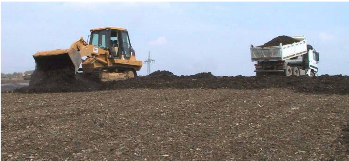
FIGURE 3 Placement on top of a landfill