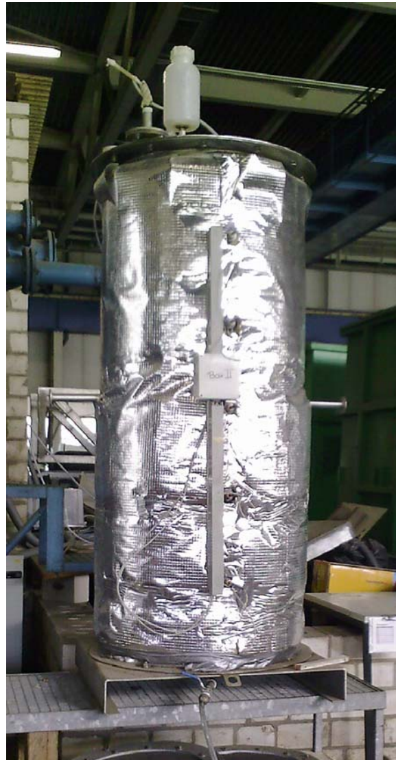
FIGURE 5 Laboratory testing equipment