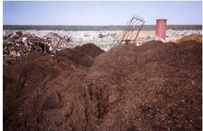
FIGURE 2 Segregation of methane oxidation material